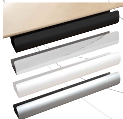
LiftPipe 429-PI02 is available in Black, White and Silver.